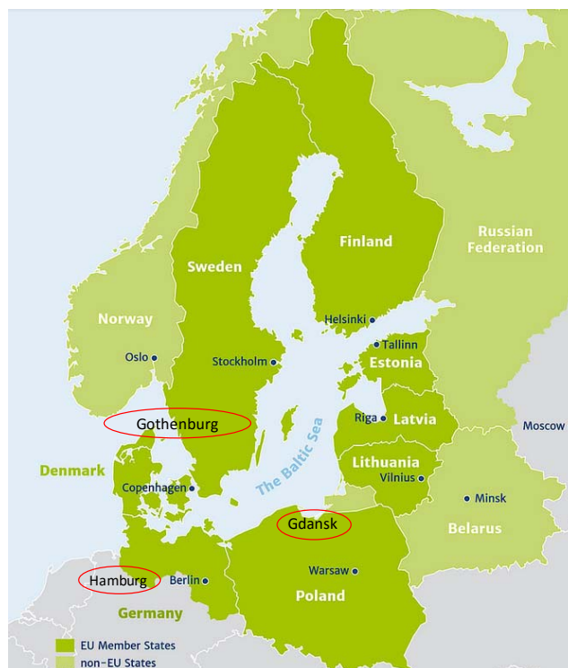
Figure 2. BSR's ports (of the EU member states) with direct shipping connections to/from China

The analysis of the statistics regarding the handling of containers within the port of the Baltic Sea has shown that the main European gateways for incoming dangerous goods into the BSR are the ports of Gdansk, Gothenburg and Hamburg (see Figure 2). They represent the BSR's main trans-shipment ports (Eurostat, 2016).