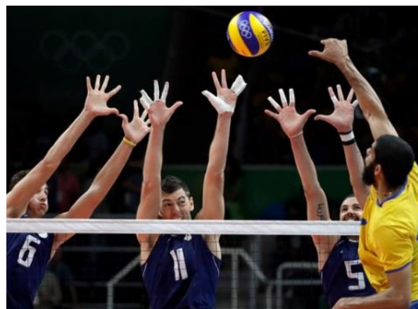
Figure 3. Finger taping [25]

at contact with the ball, sprains, strains and sometimes fractures can occur at this level. Index finger and thumb are the most exposed to injury being at the edge of the palm [24]. Even though it is a frequent injury, it is not uncommon for volleyball players to perform with sprained fingers. Taping is a solution for this kind of injury. Usually the injured finger is strapped to an adjacent, uninjured one. The thumb is immobilized separately (Fig. 3).