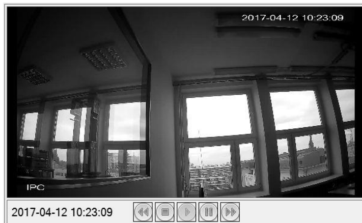
Fig. 3. A view of VideoUserControl during the visualization of video recording [own work]