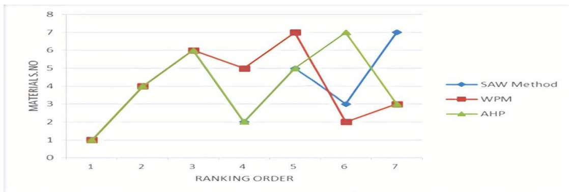
Fig. 1. Ranking to materials with equal weightings