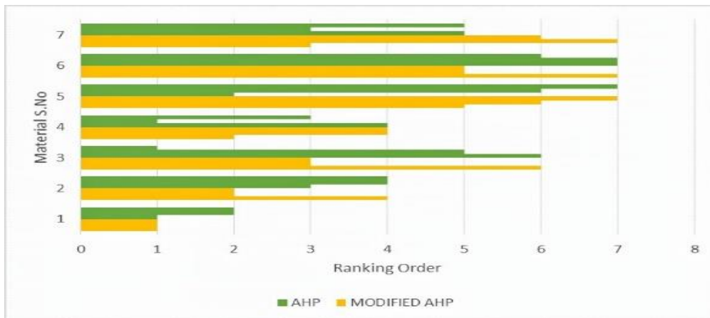
Fig. 6. Correlation of Ranks between AHP and Modified AHP Methods

It is shown in Table14 that the ranking scenario varies vast between three material types and the ranking order for first two materials have no significant changes. Modified AHP method indicates the change in rankings when swing and entropy weighing are applied, and the consequence of weighing criteria on mean weights is less. The resulting performance scores and ranks are plotted for better disclosure of the obtained results by AHP method in Figure 6. A small change in performance scores (effected by criteria weights) shows remarkable effect in ranking of materials. It can be clearly seen how the weight of Specific attribute contribute in final rankings.