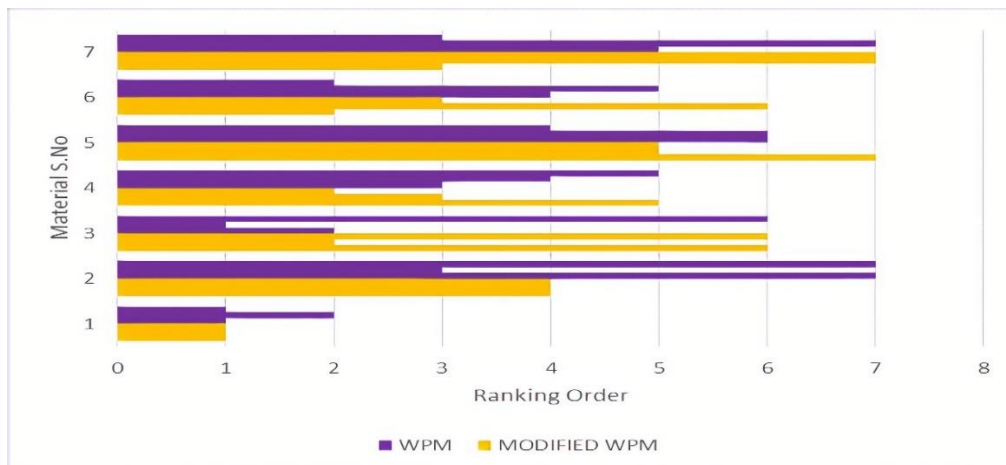
Fig. 5. Correlation of Ranks between WPM and Modified WPM Methods

It is noted in Table13 that both WPM and Modified WPM generates dissimilar rankings for six materials whereas the material rank remains unchanged irrespective of the weighing method used for a single material which can be considered as ideal material for piston manufacturing. Figure 5 illustrates the attributes sensitivity based on weighing factor of each alternative on material ranking in WPM dimensionless analysis method. It is noticed that material serial number 1 ranked top in both WPM and modified WPM and variant conditions can be seen in ranks for other materials. Weak correlation can be seen for least significant material by sensitive analysis.