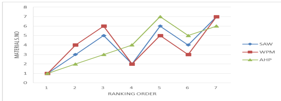
Fig. 3. Ranking to materials with Entropy weights

Present work deals with three weighing techniques firstly by considering the equal weights where the decision maker have minimum information about the criteria's and their preferences on problem objective, second method of assigning weights are done by examining the influence of particular parameter on the objective function(material selection) by its rank. Here the significant parameter can be easily focused by Decision maker. The third method based on consignment of accessible data and its correlation with criteria importance. Normalized matrix (Table 2) influenced the criteria weights in attaining performance scores