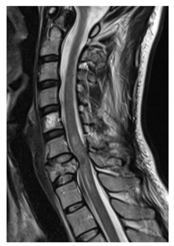
Figure 1. Burst fracture of C7 vertebral body compressive and complete SCI

incomplete SCI; the cerebro-spinal pNF-H level was more elevated in cases of complete SCI. The normal level of CSF pNF-H was determined in samples obtained by lumbar puncture from six individuals without neurologic disorders and these values were similar to the normal level set by Petzold and Shaw in 2007: 0 ng/ mL to 0.9 ng/mL. (26).