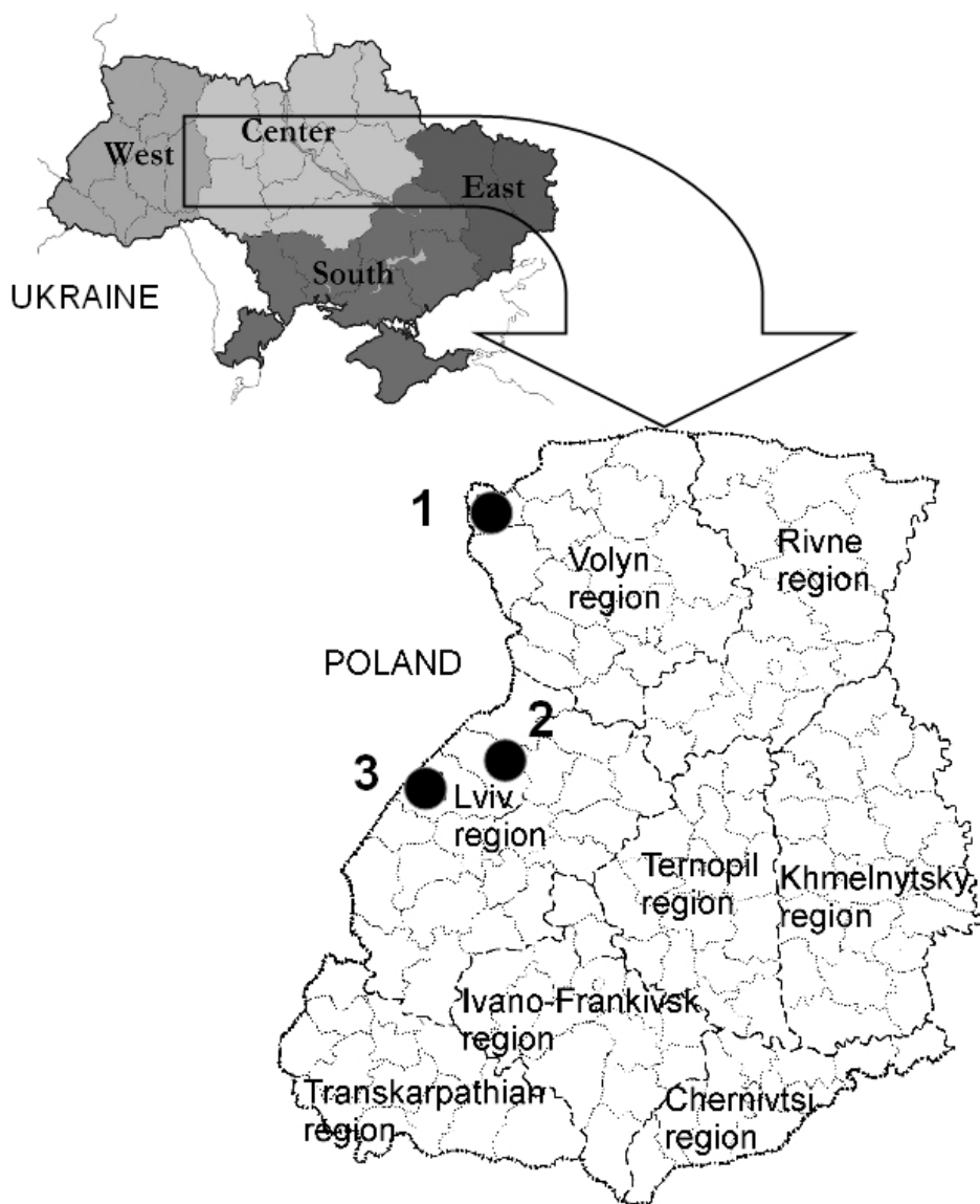
Fig. 1. Main areas of investigation. 1 – Shatsk National Nature Park, 2 – town of Zhovkva, 3 – Cholgyni Nature Reserve

duced pressure gradient. All of these factors slowed the inflow of groundwater into Lake Svityaz by 10%, which undoubtedly changed the structure of lacustrine habitats and affected Lapwing populations. The decrease in the waterline and drought stimulated overgrowth of the lake shoreline with high semiaquatic vegetation (sedges, reeds, rushes, cattails, etc.). Water saturation caused flooding of suitable breeding habitats, delaying oviposition and extending the breeding period, which increased