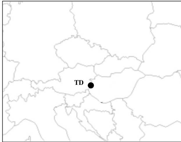
Fig. 1. Location of the Tömörd ringing site (TD)

Only one paper was published about the autumn migration dynamics of the Goldcrest in Hungary (Miklay and Csörgő 1998) because of the small number of ringed birds. One of the reasons for this is that a part of the important ringing stations work in reedbeds, where Goldcrests do not occur in larger numbers. The other reason is that the stations do not go on ringing after late October or early November, when most of the northern birds migrate through Hungary. At the Tömörd Bird Ringing Station in the west of Hungary (47°22'N, 16°41'E; Fig. 1) however, we