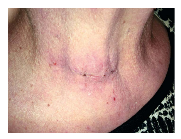
FIGURE 3. Appearance of the incision and surrounding skin 10 days after performing directed parathyroidectomy.

by overactive pathological parathyroid glands. After removal of the adenoma, the remaining suppressed glands will eventually regain their functional capacity. 8,25,32 Patients with low blood calcium levels complain of numbness and tingling in their fingertips and toes, very low concentrations can result in involuntary movements and severe muscle spasms. 25,33 Postoperative bleeding is a rare but dangerous complication, which may lead to respiratory problems and wound infection. 25,33