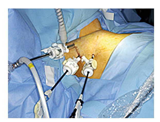
FIGURE 4. Total endoscopic parathyroidectomy.

Endoscopic surgery has similar advantages to bilateral parathyroidectomy as other minimally invasive procedures. Compared to directed parathyroidectomy, it is less invasive, it results in less postoperative pain and a better aesthetic result, but surgery is longer, technically more demanding, and requires more expensive surgical equipment.45 General anaesthesia is always required.34 Endoscopic intervention is indicated in patients with sporadic PHPT and solitary adenoma, which should be confirmed by preoperative imaging.<sup>43</sup> The procedure is not appropriate in the case of intrathyroid parathyroid adenoma, multiple parathyroid involvement, previous neck surgery, suspected parathyroid cancer, familial PHPT, secondary and tertiary hyperparathyroidism, goitre and in the obese patients. 25,34,43,45