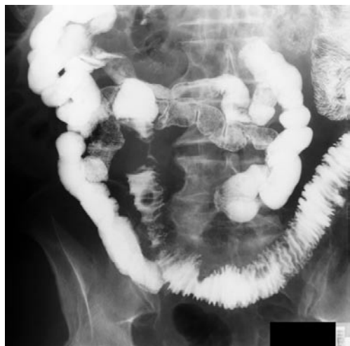
Figure 2. SBFT: Stenosis and an oval formation in the distal jejunum, causing a relative obstruction, thickened mucosal folds and irregular bowel wall proximally .

The patient was admitted to surgery. Implantation of pace maker for his arrhythmia was needed before he could be operated upon (5 days later). A 30 cm long segment of the jejunum was resected. Appendectomy was also performed. The histopathologic diagnosis was adenocarcinoma of the small bowel. One out of 17 nodes in the mesentery was found malignant. Lymphangiocarcinomatosis of the mesentery was also established.