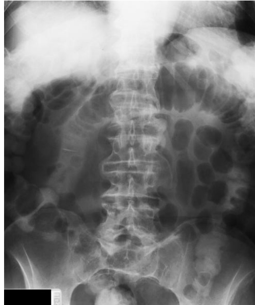
Figure 1. Abdominal plain film: dilated small bowel loops – obstruction.

An 83-year-old man with arterial hypertension was first referred to the proctologist because of difficult defecation, abdominal pain and diarrhoea lasting for about one month. On proctoscopy, polyp of 5 – times 5 mm was found in the rectum. It was resected at a later colonoscopy and sent for histological examination. Some diverticula were also observed. With the upper GI endoscopy signs of chronic atrophic gastritis were found. With abdominal ultrasonography small cysts in the right kidney were revealed. However, the results of all examinations could not explain the patient's problems. Two months later the patient returned to the emergency department, for the third time in one month, because of severe vomiting and weight loss. Haemoglobin level was found normal. Dilated small bowel was observed on abdominal plain film (Figure 1), while no signs of acute abdomen were seen on physical examination, leading abdominal surgeons at the first two patient's visits to conclusion that there was no indication for surgery. At the third patient's visit to the