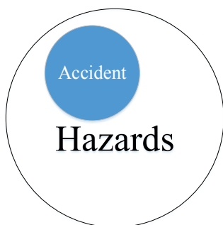
Fig. 2. Relationship of accidents and hazards

24model holds that the hazards are equivalent to the causations of the accident. From a systematic point of view, the system is a group of interconnected entities, which means that the accident is the consequence of the system migrating to the high risk status integrally. So that the failures and adverse interactions of all components in system are the causes of the accident, hazards contain human factors, physical factors, organization, organizational external factors.