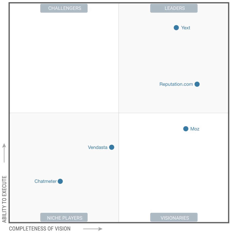
Figure 2: Traffic Insights vendors ranked using custom scoring method adapted from Gartner's