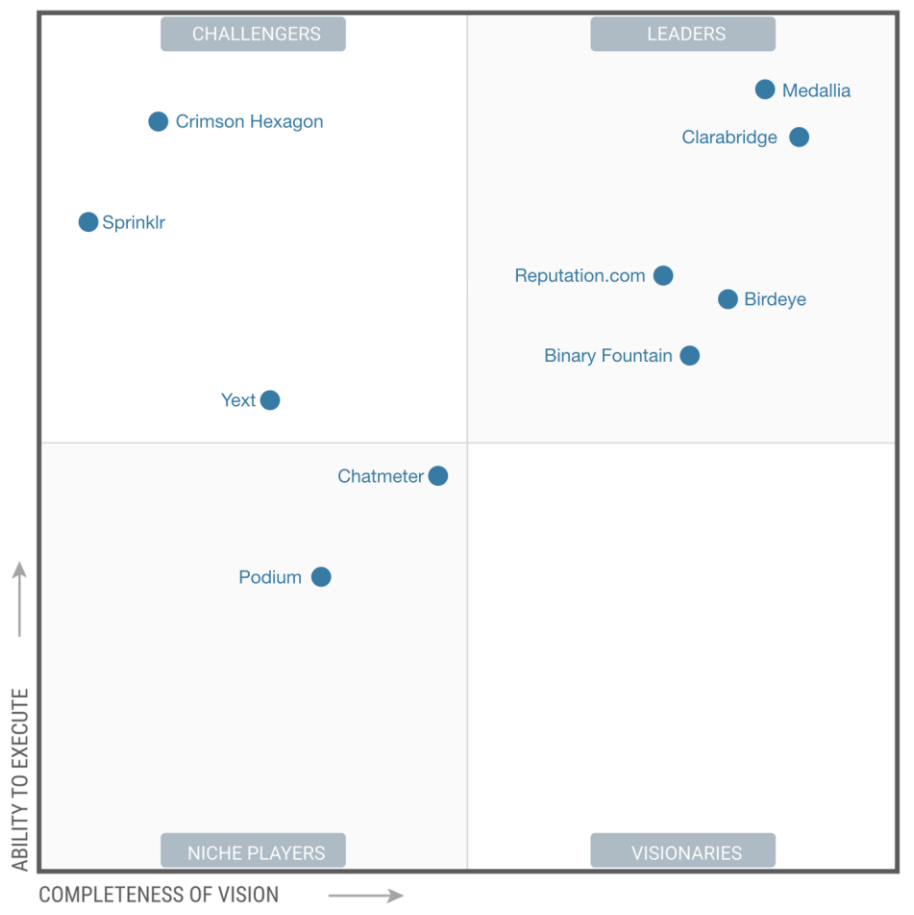
Figure 3: Operational Insights vendors ranked using custom scoring method adapted from Gartner's