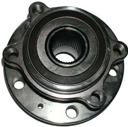
Fig. 1. Front wheel hub