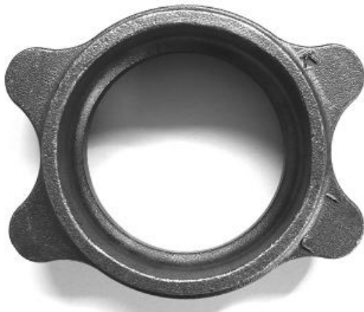
Fig. 2. Part of the front wheel hub

The FMEA include all elements of the manufacturing process for the element hub of the front wheel, because the product is a safety element mounted on vehicles, which requires a special accuracy. Each of the sub-processes of production may be affected by faults that may have an impact on the final product. Therefore, the individual operations of the production process are listed as follows to a possible defect: