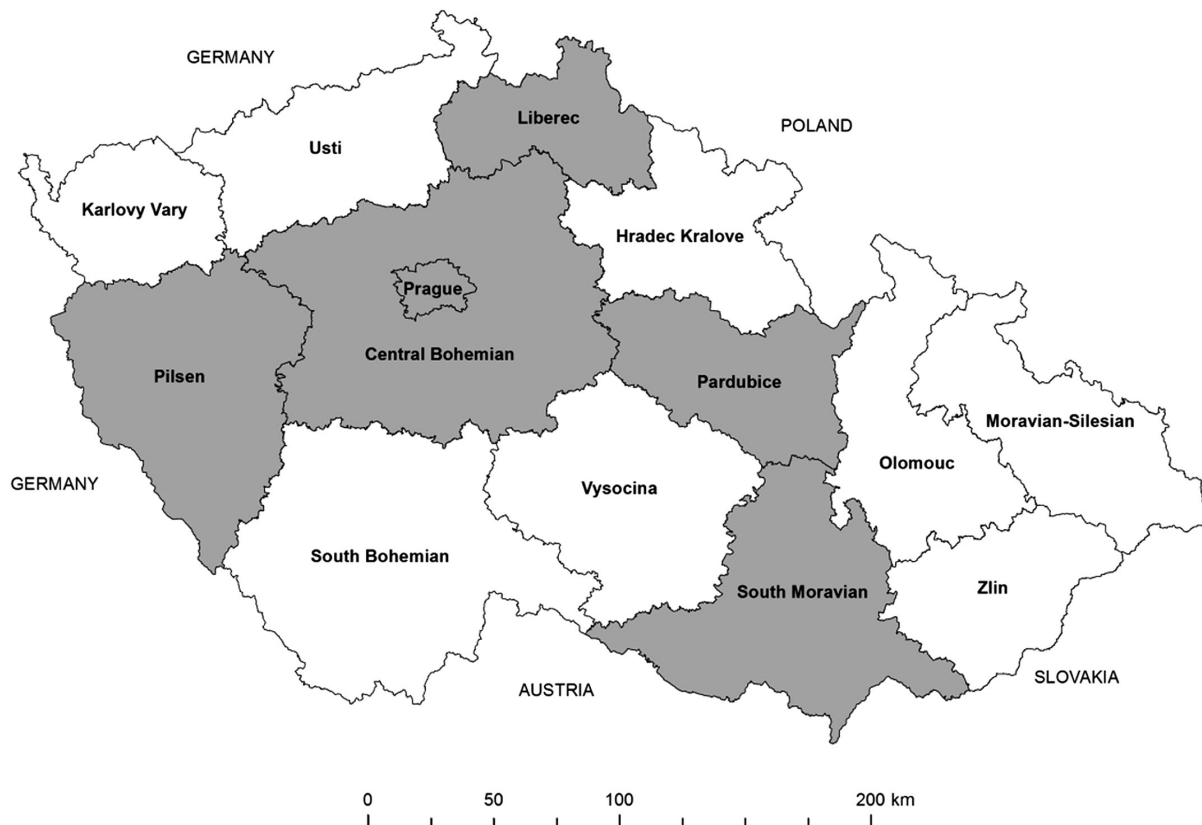
Figure 3: Czech metropolitan regions

As previously stated, the identification of a regional type enables better targeting of the innovation policy. Metropolitan regions should strive for greater cooperation among regional actors (through the formation of innovation