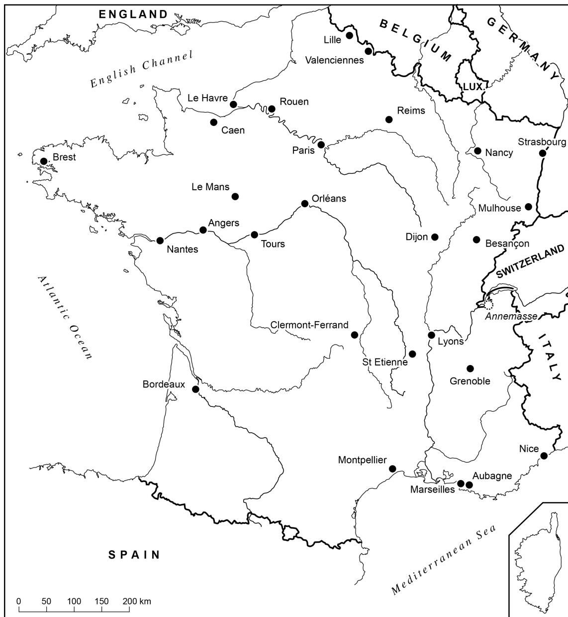
Figure 1. French cities with tramways Design V. Lahaye based on author's sketch

Wolff 2012). In most cases, left-leaning municipal governments, often supported by the Green Party in local coalitions, have implemented tramway revival schemes. However, some mayors on the right side of the political spectrum have also championed tramways in their cities (Alain Juppé in Bordeaux). In several cities (Nantes, Strasbourg, Dijon, Orléans, and most recently Toulouse), the local political debates have focused heavily on tramways and their costs.