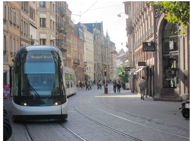
Figure 2. Tramway in the centre of Strasbourg

It is hoped that the "softened" use of public spaces through the implementation of quality landscaping alongside the tramway