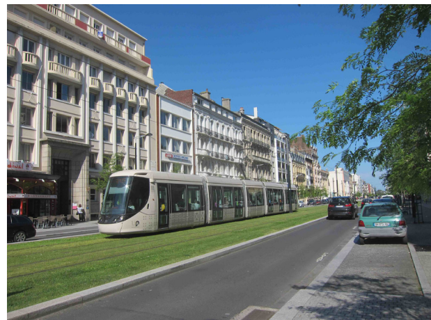
Figure 3. Tramway in le Havre

lines will lead to increased pedestrian flow, increased safety and enhanced social interaction, which in turn will encourage visitors and tourists. Greenery and bike paths parallel to the tramway tracks are supposed to reintroduce nature and healthy lifestyles in the city. In Reims, the construction of the tram network was accompanied by the planting of 1,700 trees, 34,800 bushes and more than 80,000 square meters of lawns alongside the tracks, creating a new green corridor in the city.