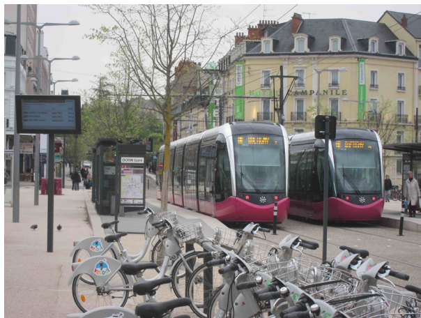
Figure 5. Tramway and bike rental stations in front of the Dijon train station

transportation routes, their frequency of services, and the size of transport fleets. Most bus lines are characterized by a low frequency of services and the use of smaller vehicles, while many bus routes run through suburbs away from the city centre, even bringing passengers to the tramway lines. The choice of a TOD strategy focusing on investment along the tramway lines, which are already designed to serve traffic-generating places such as train stations, shopping areas, hospitals, stadiums and universities, can only increase the share of tramways in public transit ridership. However, this is not the case in the largest cities: their share was insignificant in Lyon, due to the prevalence of the subway (underground subway lines represented 13% of the total network and 48% of trips) and Lille (subway 34% and 62%).