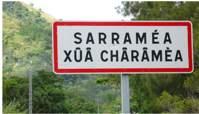
Photo 3. Bilingual road sign arriving at a Brousse village

geographers. However, this incompetence somewhat assisted the operations, as it allowed the coordinators to “spread their wings” and create the charts according to their vision. However, the low knowledge level of the basics of cartography is regretful, despite the skills concerning spatial data. It turns out that frequent use of GIS tools complicates the work of cartographers, since these tools instrument maps, trivialise the modes of cartographic presentations and limit the map to being a bunch of illustrations, replacing synthetic explanations with analyses, which are often in contrast with the text.