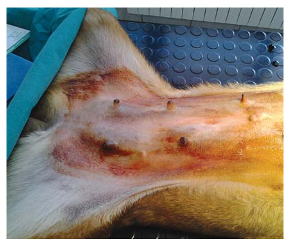
Figure 2. Mammary tumour on the cranial thoracal mammary gland (right) with metastases on the ingvinal mammary gland (9 year old Belgian Sheepdog)