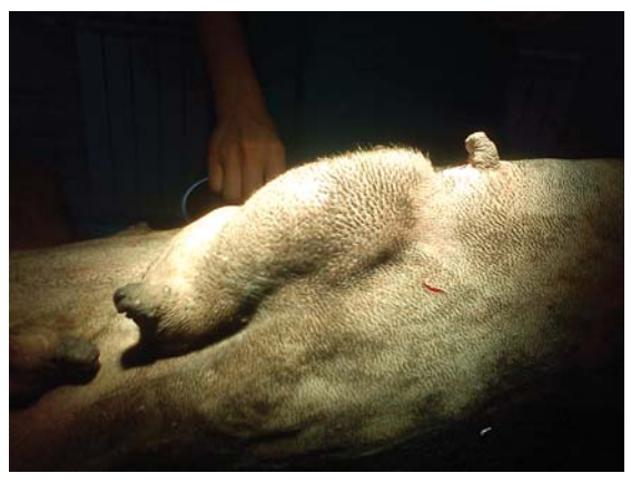
Figure 1. Mammary tumour of the cranial and caudal abdominal mammary gland- left side (6 year old Doberman Pinscher)

The only treatment was surgical removal of the tumours (simple or radical mastectomy). The owners of seven patients agreed to additional ovariohysterectomy. Radical mastectomy was performed in patients that had multiple mammary tumours. Three patients died between 20 days and 2 months after the surgery. They were presented in the Hospital with sings of dyspnea due to lung metastases, anorexia, vomiting, decreased body temperature and lethargy. The rest of the treated patients (n= 7) were monitored on a monthly basis. Six months after the treatment, these patients remained in good body condition, without any signs of health disorders. They are recommended and visit the hospital on regular check-ups every 6 months.