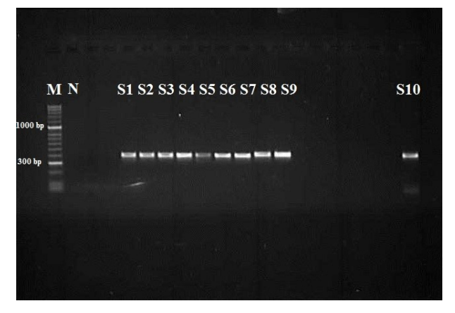
Fig. 2. PCR amplification of ITS-2 (~400 bp) of Toxocara genes on 1.5% agarose gel. M – 50 bp DNA marker, N – negative control. Samples from 1 to 7 represent Toxocara canis ; samples from 8 to 10 represent Toxocara cati

The phylogenetic tree was reconstructed for the five Toxocara species (Fig. 3). It can be clearly observed that the T. canis and T. cati isolates clustered with the respective reference strains of T. canis and T. cati .