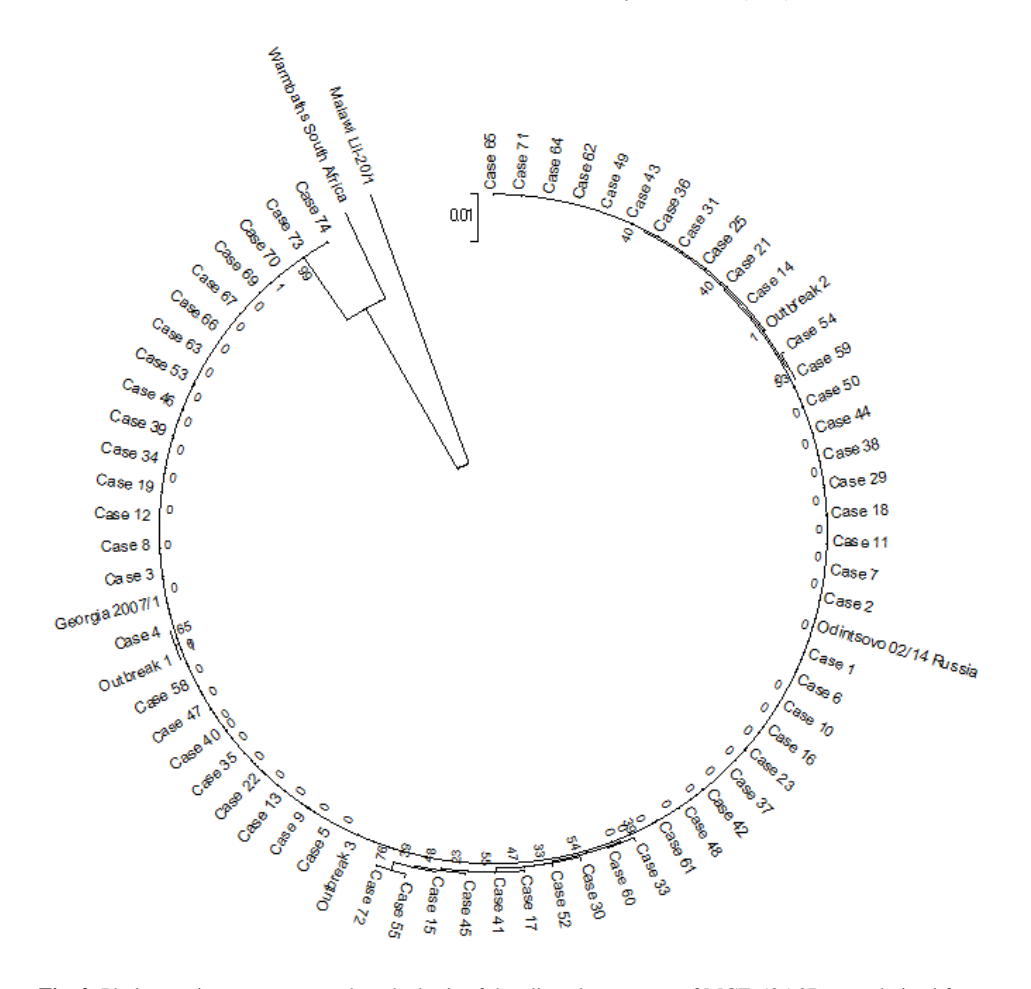
Fig. 2. Phylogenetic tree constructed on the basis of the aligned sequences of MGF-505-2R gene derived from 67 ASFV field isolates and 5 reference strains as Georgia 2007/1 and Odintsovo 2/2014 (Genotype II), Ken06.Bus (Genotype IX), Ba71V and NHV (Genotype I). The tree shows the relationships between particular genotypes and field ASFV isolates circulating in Poland. The scale bar indicates the number of nucleotide substitutions per residue

The other important factors include implementation of hygienic and sanitary requirements as well as restrictions associated with pig or pig meat product movement as well as quarantine and compartmentalisation of the areas. The other important aspect influencing the biosecurity is associated with accurate laboratory diagnosis. Because of the contagious character of ASFV as well as the economical importance of its occurrence, the diagnostic studies on this pathogen are mainly conducted by the National Reference Laboratories (NRLs) authorised by Chief Veterinary Officers of particular countries. The NRL for ASF at the National Veterinary Research Institute in Pulawy (NVRI) performs diagnosis of ASF using OIE and European Reference Laboratory (EURL) recommended diagnostic methods. All diagnostic techniques recommended for ASF diagnosis have been fully described and reviewed in details (28). Diagnostic methods used within NRL in Pulawy are represented by real-time PCR with Universal Probe Library (UPL), enzyme-linked immunosorbent assay (ELISA) for screening of ASFV antibody and confirmatory tests including immunoperoxidase test (IPT) and immunoblot assay (IB). However, it should be taken into account that ASFV DNA may be detected during