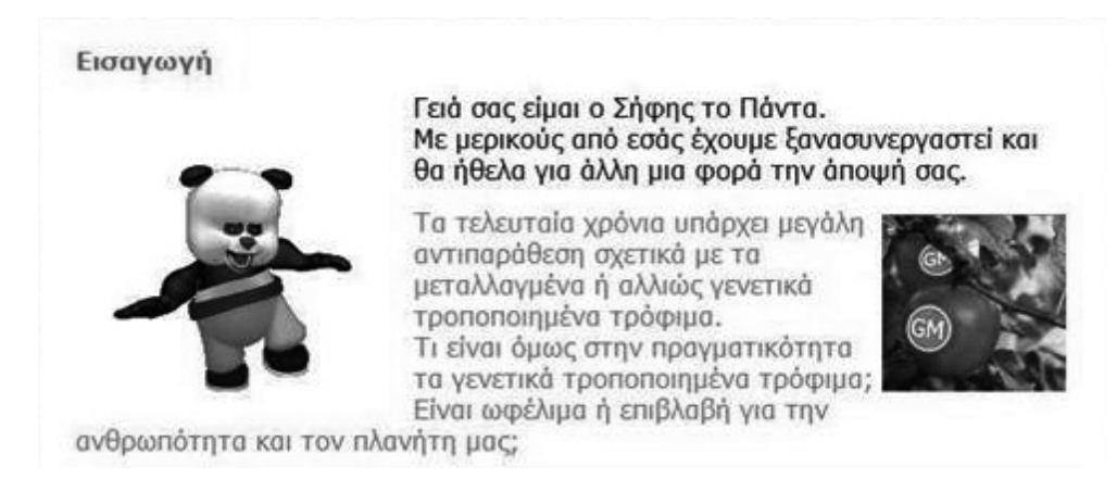
Figure 2. Presenting the problem – motivation

The second component, called "Prior knowledge activation", integrated an online forum where pupils would share their knowledge about the topic, brainstorm and express their first arguments about GMF. The conventional setting of the classroom does not offer enough time so that everyone can contribute to the dialogue. Inevitably, pupils that are introverted or have not acquired adequate language skills seldom participate. Forums give the opportunity for pupils to take their time, contemplate on their classmates' comments and voice their points of view. They can answer at a specific comment or express an alternative view in collaborative settings. The online dialogical framework gave a starting point to expand the conversation in the classroom where the teacher can provoke cognitive dissonance and challenge the pupils to reason and think critically. The teacher did not, under any circumstance, reveal his dispositions towards the topic asking the pupils to express freely their opinion and encouraging them to search for evidence. Almost all the pupils tried to acquire data from the internet, while some asked their family to enlighten them about the issue. Negative predispositions prevailed, while the alteration of the DNA chain and the negative effect such products have on health were the main characteristics mentioned.