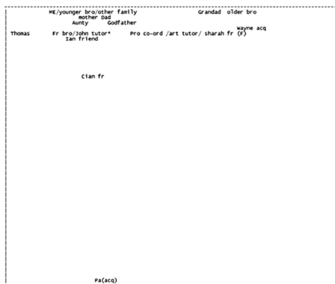
Figure 1: Map at time 1 participant 1

There is also a very clear division in the map between everyone and Pa, Kevin’s acquaintance. While it might be useful to exclude this person from the analysis this extreme positioning of an individual Kevin dislikes indicates a positive orientation towards the other people in his world.