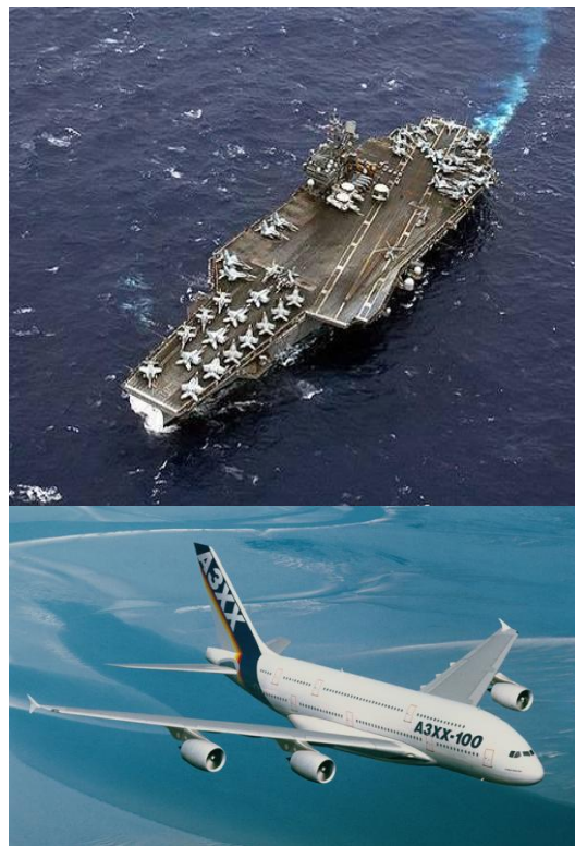
Fig. 1. One of the US aircraft carriers and the airplane A-380

A maritime vessel and an aircraft show some similarities as far as their properties are concerned. Some symbiotic relationships between a maritime vessel and an aircraft have been illustrated in Fig. 1. The quality of being able to operate safely (in Polish – bezpieczeńność 1 ) is one of the above-mentioned properties. Safe performance of any maritime or air mission highly depends on the value of safeness, including the technical safeness of the ship's structure. Safety is also affected by environmental factors and a human factor. Safeness is most often defined as a property (a characteristic, i.e. a distinguishing quality, relative in its nature) which assures that the structural arrangement of the ship (including the ship's equipment) is maintained in order to be safely operated. In [3], safeness has been defined as the opposite of the dangerousness (i.e. the quality of not being safe). For the needs of this paper, safeness ( S ) is the antonym of ( Z ) – the quality of being hazard-prone (in Polish – zagrożalność).