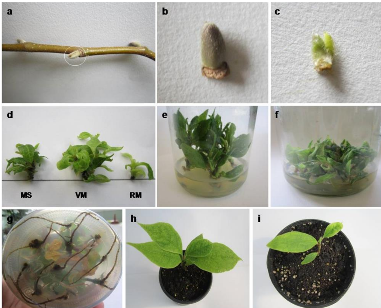
Fig. 1. Representative images of consecutive stages of in vitro propagation of magnolia

The experiment was repeated three times. The sub-culturing was performed every 60 days onto the same media and by using the same type of nodal segments.