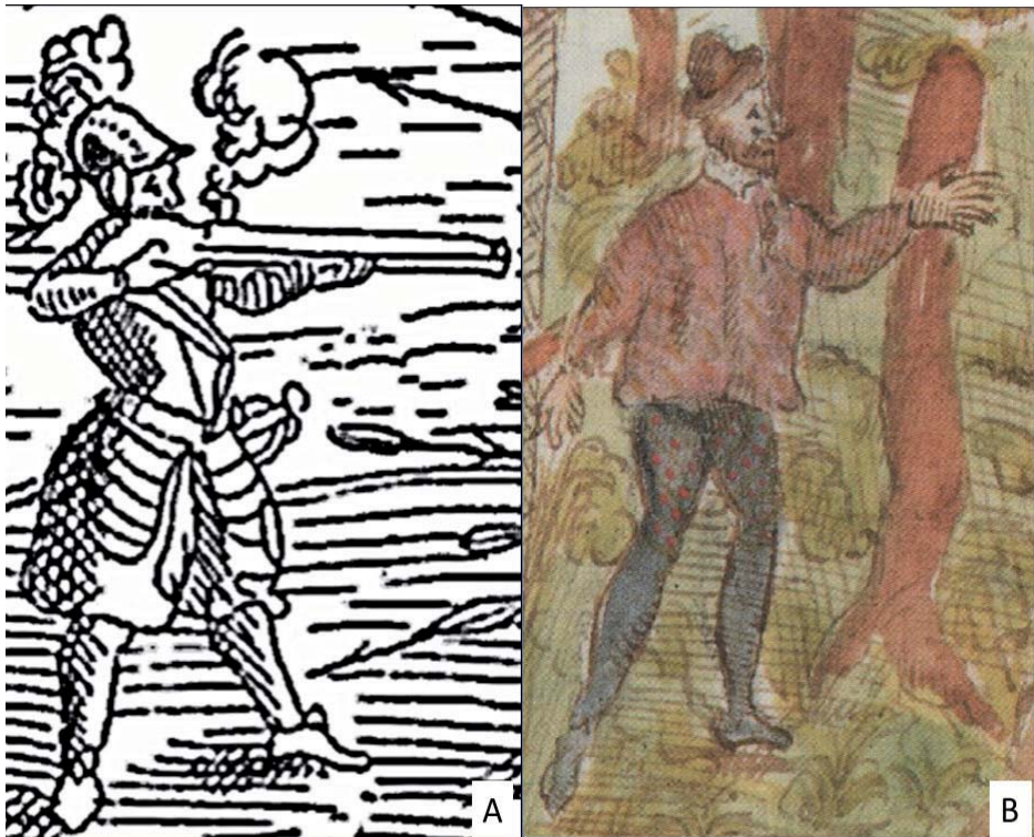
Fig. 2. (A) Samuel de Champlain (1613); (B) Alleged self-portrait of the anonymous author of the manuscript (Anonymous 1996a, b: fol. 111).

pyist under his supervision. This French explorer was born in the historical French province of Saintonge, and was baptized as a Protestant, like his parents (Thierry 2012). According to his Brief discours , S. de Champlain (1601, see also: Laverdière 1870) supposedly first visited the New World while travelling to the Caribbean territories of Cayman Islands, Bermudas, Margarita Island (Venezuela), Santo Domingo, Guadalupe, Colombia, Cuba, Panama -including the town of Portobelo-, Puerto Rico, and Mexico between 1599 and 1601. The dates and places indicated by Champlain (1601) mostly coincide with those reported in the itinerary of F. Drake's voyages in the Caribbean. Nevertheless, as alleged by Vannini de Gerulewicz (1989), it is likely that S. de Champlain never traveled to this region, and therefore wrote his manuscript by using reports about the Caribbean from other travelers. Later, S. de Champlain actually completed multiple trips to North America, where he established the first French town in Canada (Deschamps 1951). When the visual aesthetics of Champlain's Brief discours illustrations of some vertebrates such as, for example, birds and rabbits of his Planche XXIV