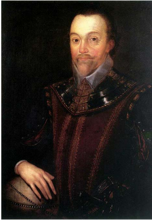
Fig. 1. Sir Francis Drake in 1590 by Marcus Gheeraerts, the Younger.