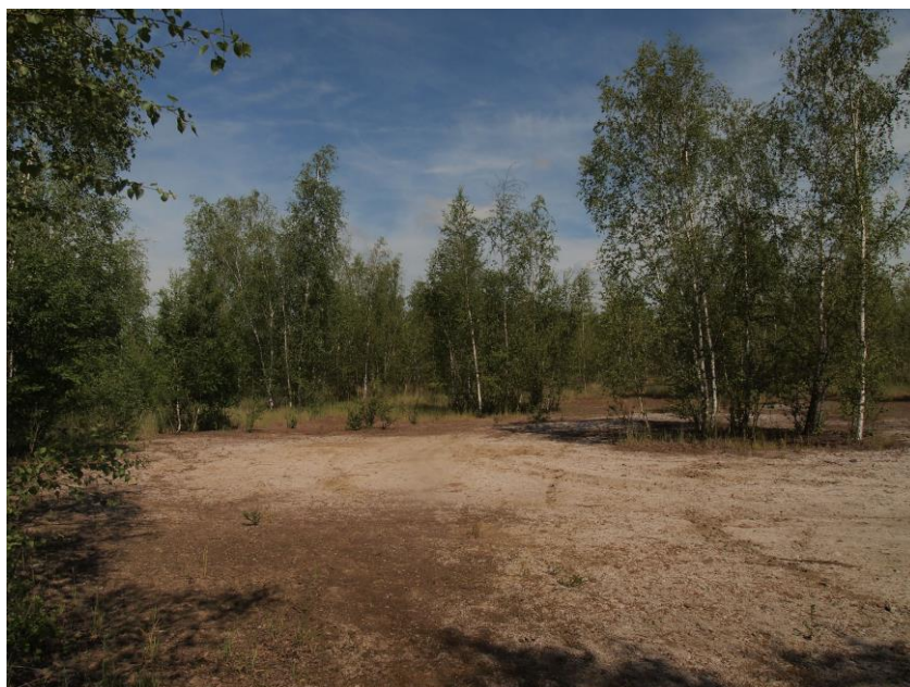
Fig. 2: Woody stands developed at the edge of the ore-washery deposit in Chvaletice during last 40 years are suppressed by new open places caused by chemical substrate changes in the soil profile. (Photo Pavel Kovář)