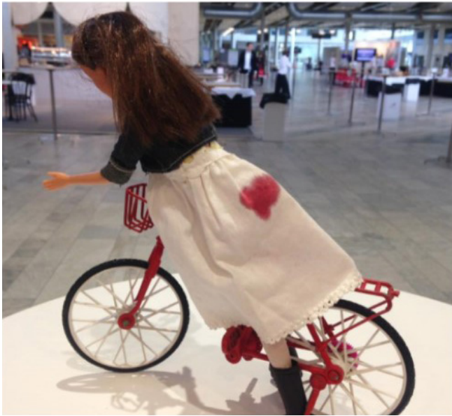
'Mini Mary' (left) was used by the Swedish Hemophilia Society's Women's Project to convey the impact of living with a bleeding disorder in meetings with school health professionals, while the 'Menstrual Cycle' (right), decorated with lingonberry and menstrual cups, stimulated interest at Sweden's most important political forum