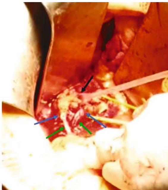
Figure 1. Hepatic hilum after cholecystectomy and CBD exploration. Black arrow: Probe inside the CBD with instillation of saline. Blue arrows: 2 connected cystic ducts. Green arrows: exit of saline by both cystic ducts after instillation through the CBD

Emergency surgery was performed, finding exacerbated chronic cholecystitis and CBD dilatation. Open cholecystectomy was performed with identification of double cystic duct that drained separately in the CBD, and its exploration showed cholangitis without verifying choledocholithiasis or plastic biliary prosthesis (Figure 1).