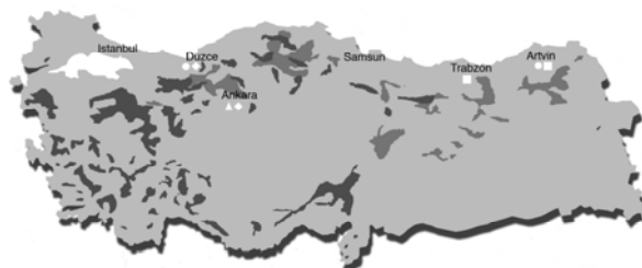
Fig. 1. Localization of the sampled areas associated with the distribution of the major pine species trees sampled (dark grey areas: P. nigra ; light grey areas: P. sylvestris ), and distribution of Bursaphelenchus species.

A total of 358 wood samples were collected from several conifer species (cedar, fir, pine, spruce) for the presence of Bursaphelenchus nematodes, in different geographic areas in the northern part of the country (Fig. 1). The greatest number of wood samples was collected from P. nigra (118 samples) and P. sylvestris (159 samples), corresponding to the species with a higher number of symptomatic trees in the sampled forest areas. Although several nematodes species were present in high numbers of wood samples,