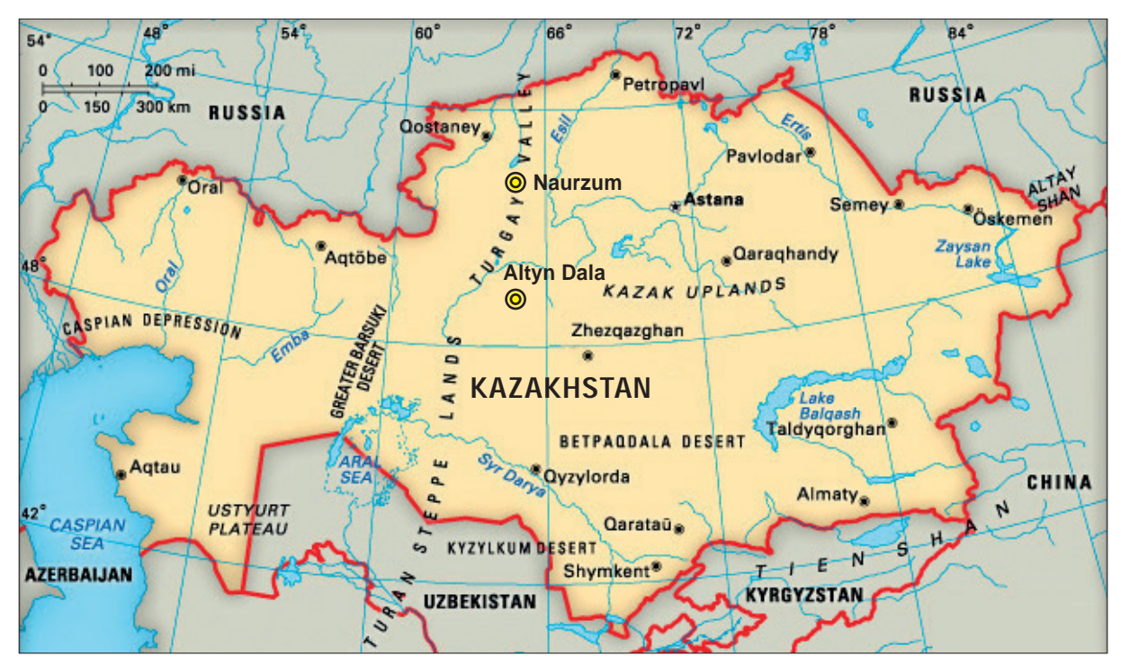
Figure 1: The investigated area with the location of the Naurzum Reserve and the Altyn Dala Reserve. Kostanay Oblast, Kazakhstan. Slika 1: Preučevano območje z lokacijama rezervatov Naurzum in Altyn Dala. Oblast Kostanaj, Kazahstan.