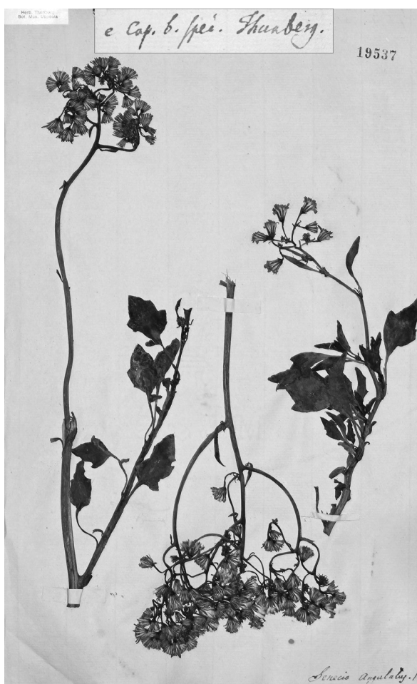
Figure 2: Lectotype of the name Cacalia scandens (UPS-18767!). A magnification of the Thunberg’s script is squared and placed on the top of the specimen.

Typification of Cacalia scandens : the protologue by Thunberg (1800: 142) consisted of a short diagnosis (“ scandens. C. [Cacalia] caule scandente, foliis triangularibus sinuato-dentatis ”) without cited synonyms and illustrations. Three specimens, which are part of the original material, were found. The first one is preserved at LD (barcode 1253428, image available at http://plants.jstor.org/specimen/ld1253428 ), and bears a plant collected by C. P. Thunberg at “ Caput bonae Spei ”. The other two specimens are part of the Thunberg’s collection at UPS [nos. 18767 (three parts of the same plant (M. Hjertson pers. comm., the Art. 9.17 can be applied), and 18768)], and they include, respectively, the Thunberg’s scripts