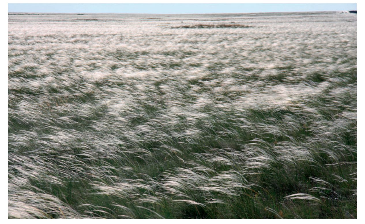
Figure 1: Temperate-dry bunch feather grass steppes (with Stipa lessingiana, Stipa capillata, Festuca valesiaca ) on the dark chestnut carbonate heavy loam soil, Turgai Plateau, Naurzum State Natural Reserve, Kazakhstan. Slika 1: Zmerno suha stepa z bodalico (z vrstami Stipa lessingiana, Stipa capillata, Festuca valesiaca ) na temni kostanjevi karbonatni težko ilovnati prsti, plato Turgai, državni naravni rezervat Naurzum, Kazahstan.

In total, dry steppes make up 7.1% (192,513.1 km<sup>2</sup>) of the land area of Kazachstan. Stipa lessingiana steppes were very common on the plains of the Sub-Ural and the Turgai Plateau. Fescue-feather grass ( Stipa lessingiana – Festuca valesiaca ) steppes with xerophytic forbs ( Galatella tatarica , Pyrethrum achillaefolium ) on carbonate soils