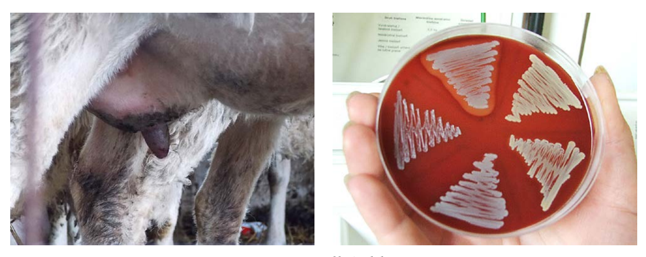
Fig. 1. Peracute mastitis caused by Staphylococcus aureus

The bacteriological examinations were performed according to the commonly accepted rules [11]. Milk samples (0.05 ml) were inoculated onto blood agar (Oxoid, UK) and cultivated at 37 °C for 24 hours. Based on the colony morphology and Gram staining, bacteria Staphylococcus spp. were selected for the tube coagulase test (Staphylo PK, ImunaPharm, Slovakia). The suspected colonies of Staphylococ -