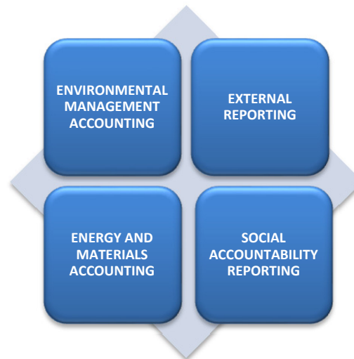
Figure 3. Internal and external reporting of financial and non-financial data

Fig. 3 clearly demonstrates the four approaches to environmental accounting (Olson and Jonall 2008:19). Fig. 3 depicts the EMA approach, including the internal, external, financial and non-financial perspectives (Bartholomeo et al. 2000).