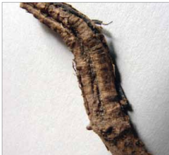
Figure 3. Lateral roots completely damaged by pathogens of Phytophthora genus. The canker (in the middle) is being healed by callus tissues (from both sides) but rhizomorphs of Armillaria sp., which are attached to the root surface, (above) started secondary infection