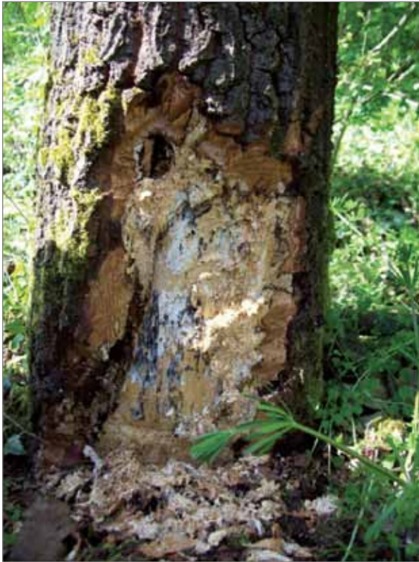
Figure 4. Mycelium of Kretzschmaria deusta destroying bark and wood of stressed oak trees

nae), etc. or stem-decaying fungi ( Fomes fomentarius (L.) J.J. Kickx, Kretzschmaria deusta (Hoffm.) P.M.D. Martin (Fig. 4), Stereum spp., Trametes spp., Phellinus igniarius (L.) Quél. and P. robustus (P. Karst.) Bourdot & Galzin, etc) is usually hard to prevent.