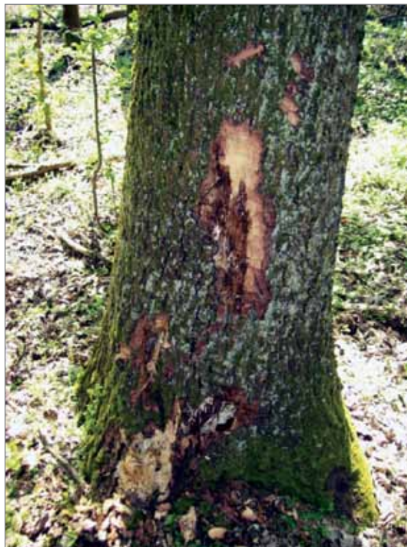
Figure 2. Mycelial fans of Armillaria gallica developing under the bark of declining oak trees

There are considerable knowledge gaps about the oak decline phenomenon; especially processes leading to the deterioration of tree health and possible death are barely investigated. The visible symptoms of disorders are often too general and therefore it becomes difficult to find practical solutions to mitigate its consequences. In particular, there is little understanding of how the extreme weather conditions influence the subtle interaction between the local population of tree-hosts, pathogens and insect pests. How do host–pathogen interactions change if abiotic stress disrupts physiological processes in oaks? It is of major importance to recognise the decline process in the initial phase, because once the decline syndrome starts, it is hard to stop its further development. Also the involvement of contributing factors such as secondary insect pests ( Cerambyx spp., Agrillus spp., Scolytus intricatus (Ratz.) (Coleoptera: Scolyti-