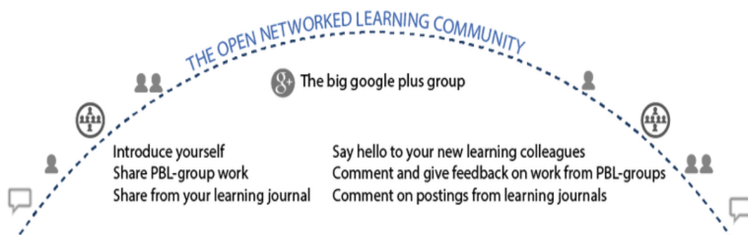
Figure 2. An overview of work in PBL groups

A problem-based learning (PBL) approach (Dolmans, de Grave, Wolfhagen, & van der Vleuten, 2005) was used in the course as the core instructional design to explore course topics and nurture interactions in small groups. Each PBL group consisted of seven to nine learners from different institutions (mixing institutional learners with open learners) each with a facilitator from one of the host universities. There were six PBL groups in the course; each had one facilitator and one co-facilitator who was a previous course participants. The work in the PBL groups was based on a scenario for each of the course topics. In the PBL groups, participants collaborated synchronously and asynchronously to work on the weekly scenario and sharing their results from their inquiry in the main course community (on Google+). Each PBL group had also its community (on Google+) where the group work and discussions occurred. Figure 2 shows an overview of the work in PBL groups.