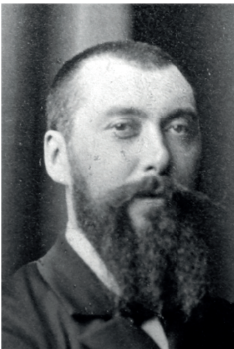
Fig. 1. Ch.S. Féré

As mentioned above, in his experiment, Féré attached two electrodes connected in series to a weak source of electricity and to a galvanometer to the forearm of the patient whom he later subjected to a range of sonic, olfactory, and visual stimuli. Such stimuli had the galvanometer pointer moving. Initially, Féré believed this to be the result of friction on dry skin. Yet Jaques-Arsene d'Arsonval (1851–1940), a physicist he collaborated with, realised that the change in conductivity was linked to sweating (d'Arsonval 1888). Thus, what we refer today as the 'Féré phenomenon' should more properly and justly be called 'the phenomenon of Féré – d'Arsonval'.