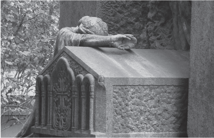
Fig. 6. Tarchanoff's grave in Petersburg

After his death in 1908, Tarchanoff was first temporarily buried in a Kraków cemetery, yet his body was moved to Saint Petersburg where it was finally interred in the cemetery by the Alexander Nevsky Lavra.