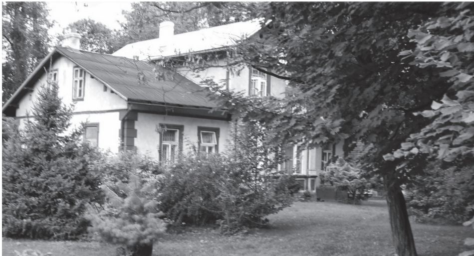
Fig. 4. Tarchanoff's house in Nawojowa Góra (Poland)