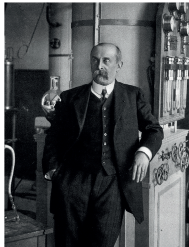
Fig. 2. J.A. d'Arsonval

In his publication from 1890, Ivan Tarchanoff presents the discovery that the galvanometer reacts similarly to stimuli even in the absence of an external source of energy (Tarchanoff 1890). The scientist attached electrodes to two randomly chosen points