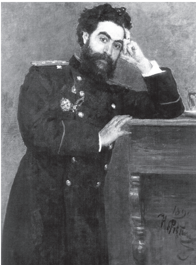
Fig. 3. I. Tarchanoff as professor of the Imperial Military Medico-Surgical Academy (by I. Repin)

Ivan Tarchanoff (born Ivane Tarchan Mauravov Tarkhnishvili), in fact the only East European academic with a significant contribution to the scientific foundations for polygraph examinations, is moreover an exceedingly interesting figure. He was a great scholar of European format, symbolically combining the nations of Central and Eastern Europe. A Georgian aristocrat, a graduate of a Russian university and later a member of the Russian faculty, a professor of the Military Medico-Surgical Academy in Saint Petersburg, he was an avid experimenter in what is broadly construed as physiology and a promoter of science.