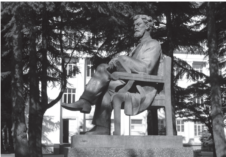
Fig. 7. Monument to Tarchanoff in Tbilisi

A monument to Ivan Tarchanoff can be found in Tbilisi, on the front of the main building of the Medical University. This is how a co-discoverer of the galvanic skin response symbolically brought together Russians, Georgians, and Poles.