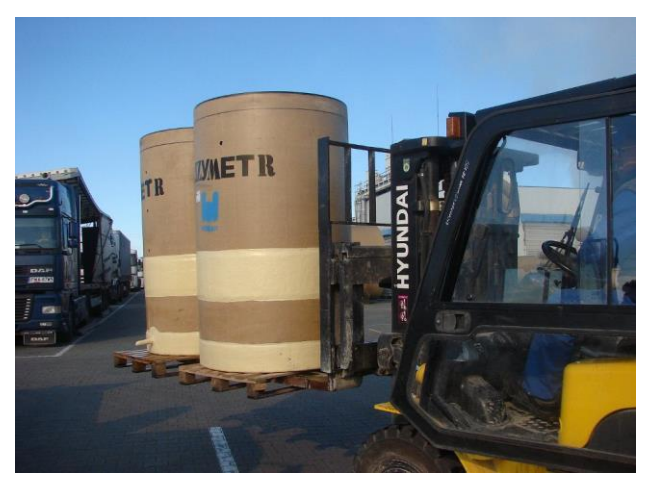
Fig. 2. Classic lysimeters

In both classic and weighing lysimeters, additional measuring equipment is often installed, which allows the measurement of, for example, the humidity of the material being tested or its temperature. It is possible to determine not only seepage time through the aeration zone, but also to correlate this with soil moisture content (SOLTYSIAK ET AL., 2018). Meteorological stations are often located near the lysimeters in order to obtain precise data on the amount of rainfall or changes in air temperature. These data can be used to make forecasts on water balance or leaching, e.g. based on artificial neural networks (NOURANI ET AL., 2017a b; POLAP ET AL., 2018) Lysimeter stations are often created that are equipped with several or even several dozen lysimeters. Filling the lysimeters with different types of material and planting different types of vegetation on them - most often different types of crops - allows the experimenter to obtain, amongst others, enormous amounts of data on the dependence between the plant species and their demand for water and soil type and the numerical value for evapotranspiration.