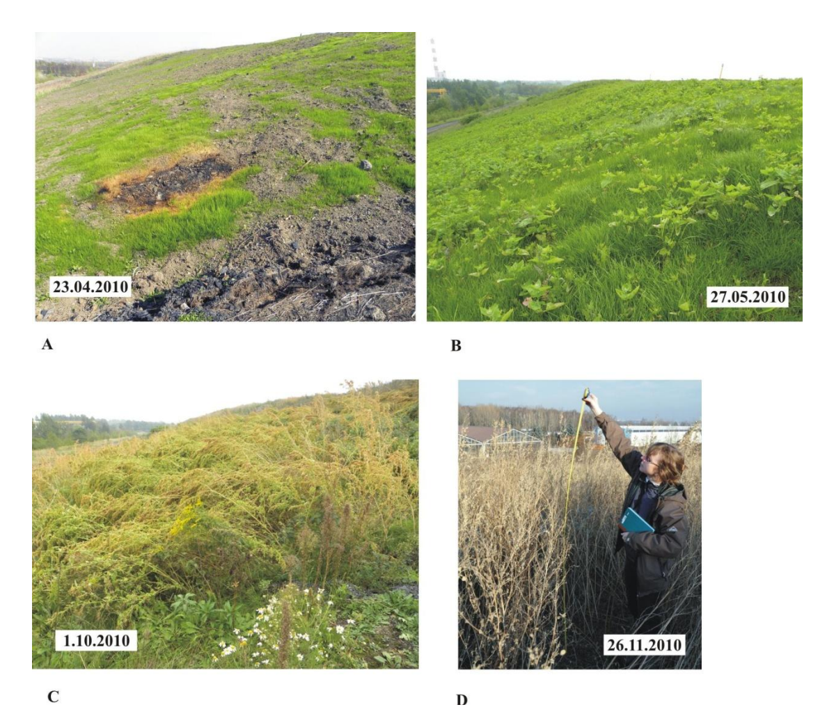
Fig. 4. The rebuilt central part of the northern slope of the Katowice-Wełnowiec dump. A – New grass sown on the rebuilt part of the slope; B– Atriplex nitens appearing in the grass; C, D – Domination and giant size of Atriplex nitens (J. Ciesielczuk)

The northern slope of the dump was investigated again on October 1 and November 26, 2010. The rebuilt part of the northern slope of the dump was then dominated by Solanum nigrum and Atriplex nitens , each up to 2 m in size. Other plants such as Artemisia vulgaris , Sonchus asper , Verbascum thapsus , and Amaranthus retroflexus also attained this size. Most of the plants here were seen to reach and even exceed their maximum sizes as given in the literature (Table 2, Fig. 5).