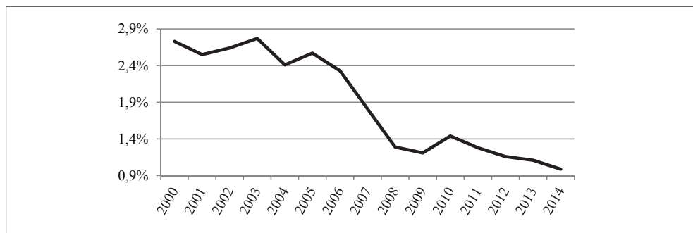
FIGURE 3. Work “in the shadow economy” as a percentage of total employment.

In this section, we analyse a specific type of informal workers. Because of the data limitations, we use particular information from the Labour Force Survey to indicate unemployed people who undertake any kind of work 5 . This method, used in other studies (Cichocki & Tyrowicz, 2011; Tyrowicz & Cichocki, 2011), relies on comparing two answers in the LFS questionnaire: firstly, about current occupational activity (meaning, if a respondent performed any work in last week); secondly, about being registered in a local labour office. A double positive answer is considered as identification of informal work (Cichocki & Tyrowicz, 2011). Obviously, by using this method we analyse only a single type of informal workers, namely those who declare their unemployment. Other types of informal employment, such as employees in formal entities with second unregistered jobs, bogus self-employed individuals or workers who receive enveloped wages cannot be analysed using this kind of data. Results of our estimations are presented in Figure 3.