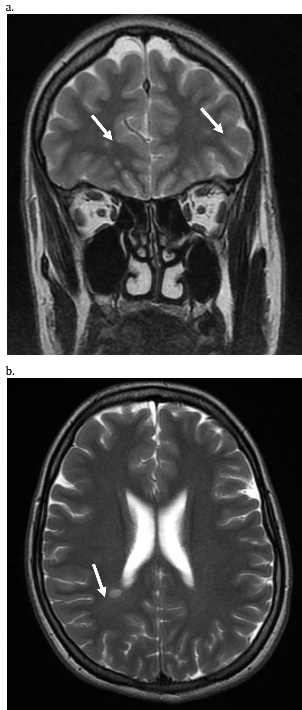
Fig 2. White matter hyperintensities in the frontal lobe (a.) and parietal area (b.) in SCH+WM patient.

The last one frequency band was 70-100Hz and in this case stopband attenuation was set on 20dB. Passband ripple was 3dB for both filters and ripple factor \varepsilon value was determined by: