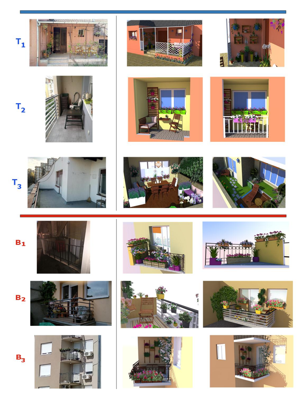
Figure 4: The examples of the terraces (T_1, T_2, \text{ and } T_3) and balconies (B_1, B_2, \text{ and } B_3) selected. The present conditions are shown on the left, whereas the new designs with greenery are shown on the right.

The third terrace (T3) is a fourth-floor roof terrace, facing south and covering an area of 30 m2. Figure 4 displays two different designs of this space. One is an urban and modern garden terrace with potted plants and a big gathering space, whereas the other is a roof garden with lawn grass, decorative trees, shrubs, and shallow-rooting flowers highly tolerant to insolation and wind. The first balcony (B1) is a triangle-shaped balcony also facing south. It