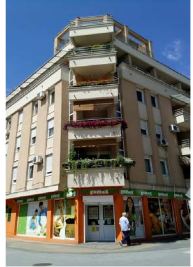
Figure 2. A corner building with balcony greenery increasing its aesthetic value

Almost all flower species, some trees, shrubs, and climbers can be grown on terraces and balconies. Their selection depends mainly on the planting location climate, insolation, and wind. During the design of these spaces, the following factors were taken into account: the appearance and design of spaces, the height (floor) of terraces and balconies and floor-specific climate conditions, and the meticulous selection of plants for every balcony and terrace with plant-specific pots and compost types.