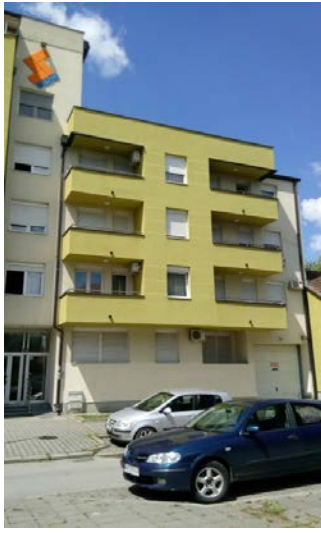
Figure 1. An example of bare balconies devoid of greenery

Nejati et al., 2016; Urlich et al., 1991; Van den Berg et al., 2010; Wolch et al., 2014; Kaplan et al., 2003) that greenery can have positive effects on the human mood, which is consistent with the results of this survey.