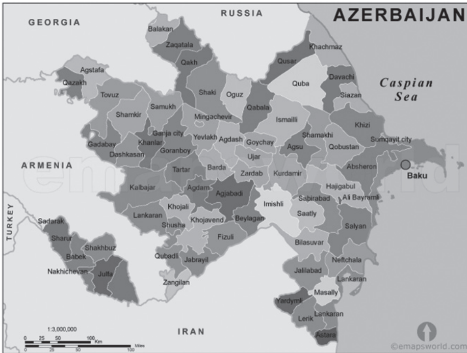
Figure 1. Project areas include the southern Astara-Lankaran region, Sheki-Gabala in the western Azerbaijan and the Absheron Peninsula surrounding the capital, Baku (eMapsWorld, n.d.).

River by the road leading to the Ballabur Tower dating back to the 8 th to 9 th centuries. The tourist information center in Lankaran and the cultural center in Kokolos have acted as the main hubs in development of marketing materials and channels of the region and as educational facilities in the promotion of conservation of cultural and historical roots of local traditions, respectively.