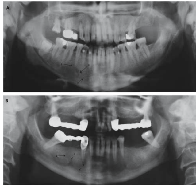
Figure 1. Panoramic radiographs of two patients 35 (Fig 1A) and 58 (Fig 1B) years old respectively, showing the mental foramen (arrow No1), the endosteal canal of the anterior loop of the inferior alveolar neurovascular bundle (arrow No2) and the mandibular incisive canal (arrow No3)

remains within the incisive bony canal and forms a nerve plexus that innervates the pulpal tissues of the mandibular first premolar, canine and incisors via the dental branches 1 .