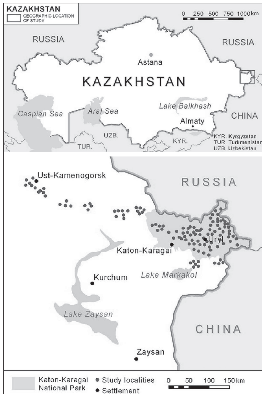
Fig. 1. Location map of the study area, East Kazakhstan, with the marked investigated localities

The collected biotic material was dried, fixed in 1.5% formaldehyde or kept alive in the Petri dishes with sterile BG11 nutrient medium. Soil samples were placed on agar plots with BG11 nutrient medium in Petri dishes and cultivated under laboratory conditions for 4 weeks. Diatom permanent slides were prepared in compliance with standard procedures (Houk 2003).