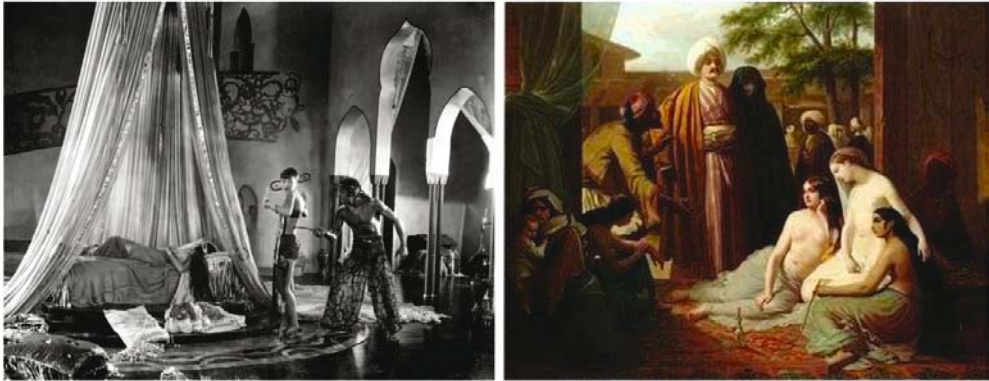
Figure 1. Douglas Fairbanks's Thief of Baghdad (1924) was noteworthy for the cost of the lavish sets and costumes, and certain special effects (flying horses, flying carpets) were imitated in Powell's Thief of Bagdad (1940). Figure 2. Typical British Orientalist painting: possibly Thomas Malton, 1748–1804.

Figures 3–4. The eye of the opening scene of The Thief of Bagdad prepares the viewer for a visual feast of Technicolor and special effects.