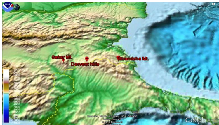
Fig. 1 3d digital elevation model of the Sakar-Strandzha morphostructural zone (DEM Etop01-ice surface, NOAA; Basemap: Google Earth)

In morphographic and seismic-tectonics (Fig.2) causes the Sakar-Strandzha morphostructural zone is divided into three areas: Sakar one, Derwent hills and Strandzha one.