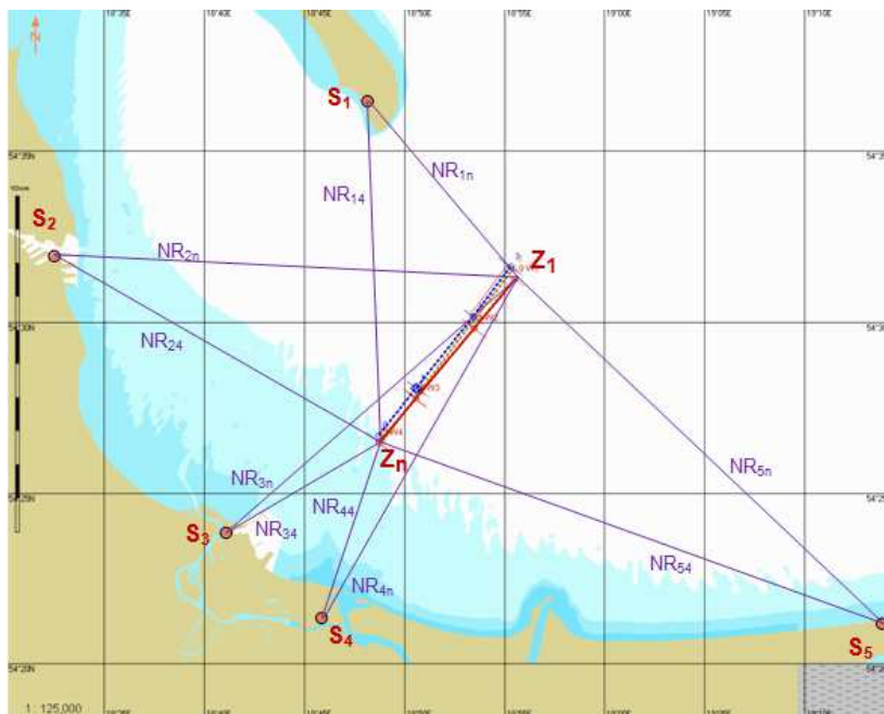
Fig. 1. Measurement structure [own study]

The Danish attenuation function is characterized with such properties, that beyond the admissible range \Delta\bar{v} , it decreases ex-potentially. The following is a form of the attenuation function [8]: