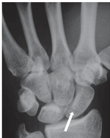
Fig. 2. Secondary radiography of wrist, triquetrum and hamate fractures (the arrows)