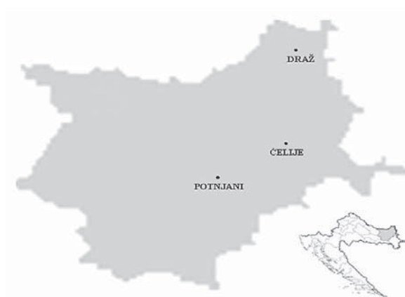
Figure 1 Study sites Draž, Čelije and Potnjani in eastern Croatia.

In the three communities, the residents use drinking water from wells (tube wells and dug wells) by pumping it into their household water pipes. A total of 90 samples of drinking water were collected: 56 samples in May and June of 2005 and 2006, and 34