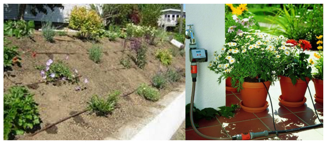
Figure 2 Use of drip irrigation for ornamental plants