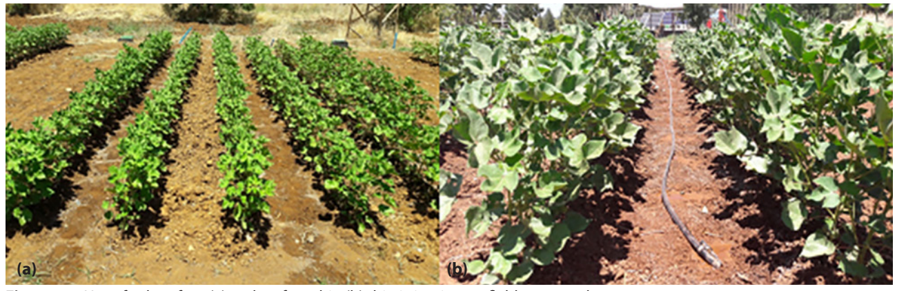
Figure 3 Use of subsurface (a) and surface drip (b) drip irrigation on field crops such as cotton

experiences required for its design, install, operation and management.