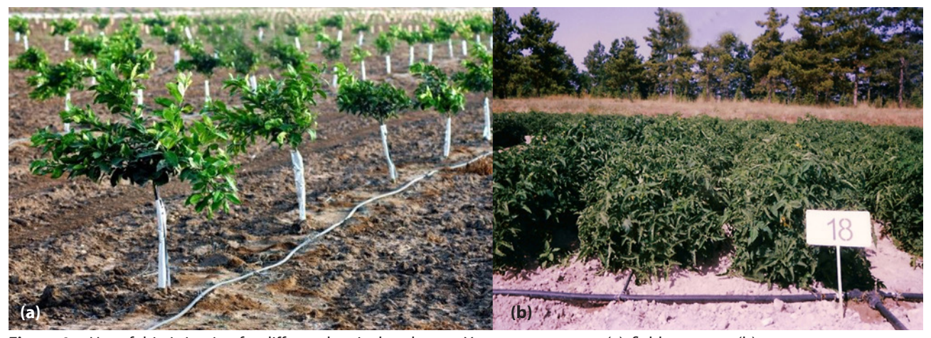
Figure 1 Use of drip irrigation for different horticultural crops. Young orange trees (a), field tomatoes (b) Source: (a) – anonymous, 2019b; (b) – Çetin and Uygan, 2008

water use by 30% to 70% and raises crop yields by 20% to 90% depending on soil, climatic and crop characteristics, and farmers practices if it is properly designed, installed and operated (Postel et al., 2001; Çetın and Bilgel, 2002). In addition, considering water savings and higher yields by drip irrigation, water use efficiency also increases at least by 50% (Chartzoulakis and Bertaki, 2015).