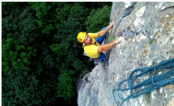
Fig. 2 Climb Cukrová homoľa ("Sugar Tower")

With regard to nature conservation, mountaineering is permitted from 1 July to 31 January at the most visited sectors of the National Nature Reserve of Zádielska dolina ("Zadiel Gorge). Other sectors are open either earlier or later than 1 July. Mountaineering will be allowed in another period, if the site of nesting migratory change.