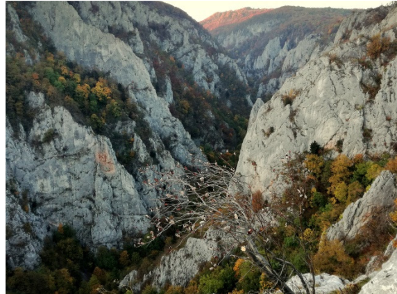
Fig. 1 Huge walls of Zádielska dolina ("Zadiel Gorge")

There are also caves in the rocks of Zádielska dolina ("Zadiel Gorge"). Among the most famous caves belong: Tajná jaskyňa ("Mysterious Cave"), Erna ("Erna Cave"), Zrnov Previs ("Zrnov Overhang